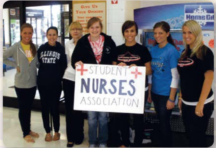
SNA members at Cub Foods fundraiser