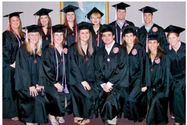
Accelerated B.S.N. graduates