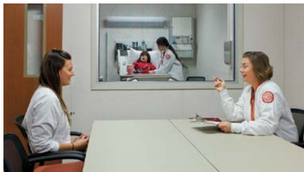
Debriefing room with two-way mirror