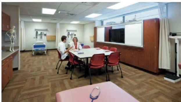
Health Assessment lab