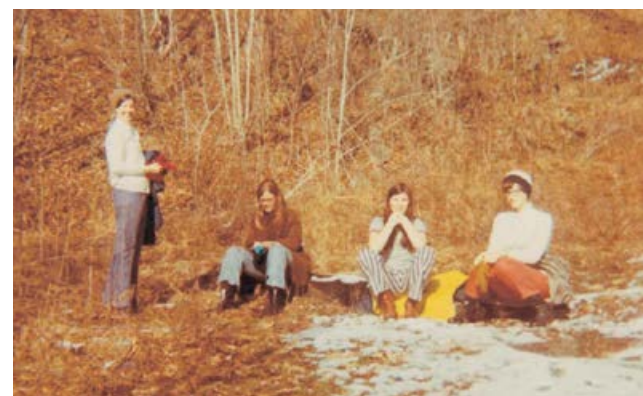
Students on the first Transcultural trip to Harlan County, Kentucky—students had the opportunity to go hiking in the area.

West Berlin —Johannesstift Hospital and Evangelische Johannesstift Hospital