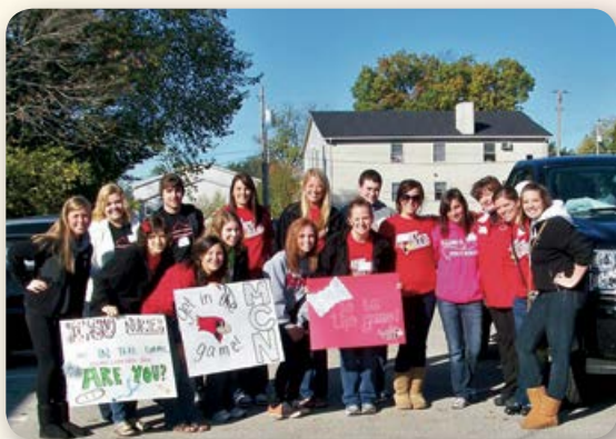
SNA members in the Homecoming parade