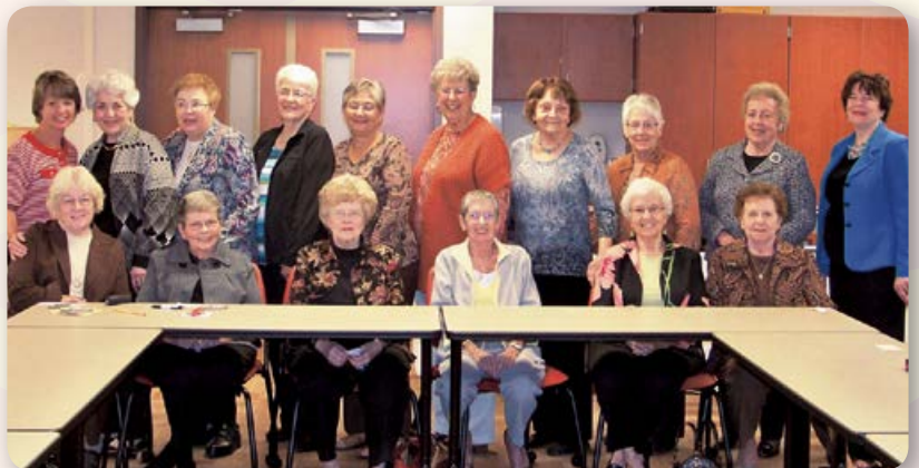
Class of 1954 luncheon at the Nursing Simulation Lab