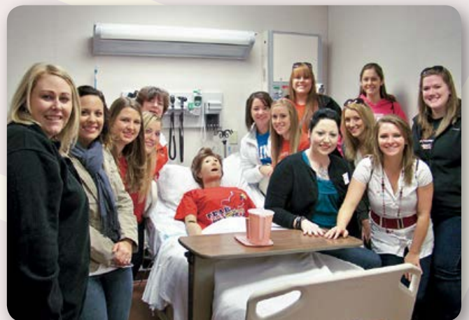
Homecoming NSL open house