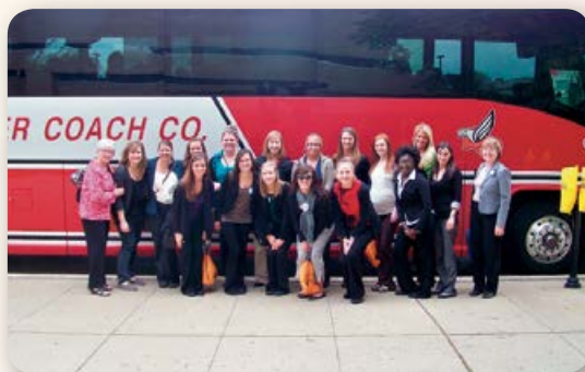
MCN students at the 2012 Student Nurse Political Action Day in Springfield