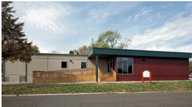
MCN Nursing Simulation Lab

Illinois State University celebrated the next step in preparing outstanding future nurses with the grand opening of the MCN Nursing Simulation Laboratory in September. The new laboratory, located on the corner of Normal Avenue and Locust Street, provides students with technologically advanced assessment labs, classrooms, and patient simulation areas that mimic real-world nursing situations.