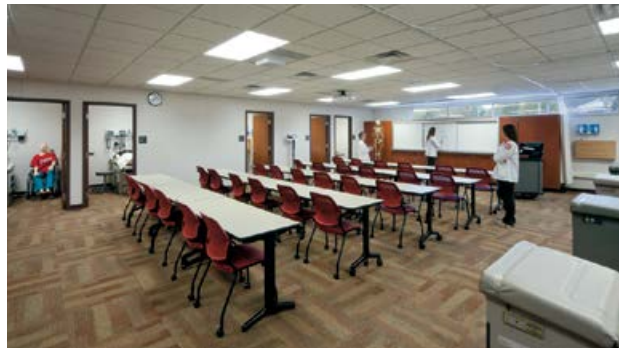
Graduate program classroom and lab