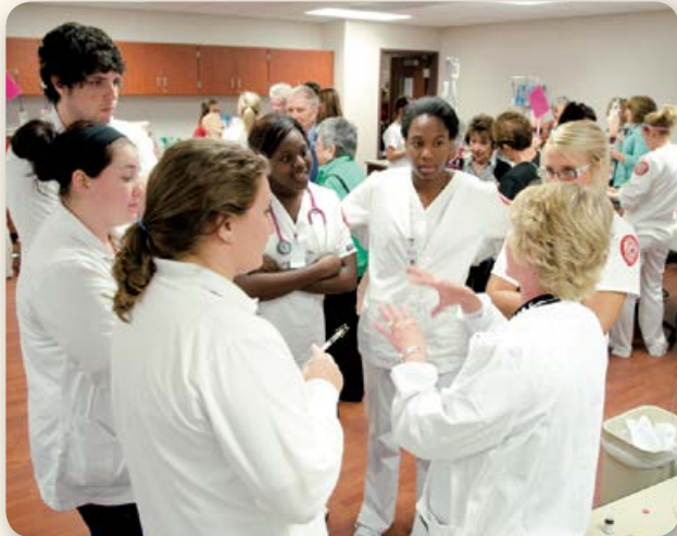
Nursing Simulation Laboratory grand opening

Faculty, staff, and students participated in a variety of events throughout the year.