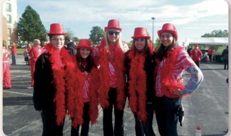
SNA members participated in the Heart Walk