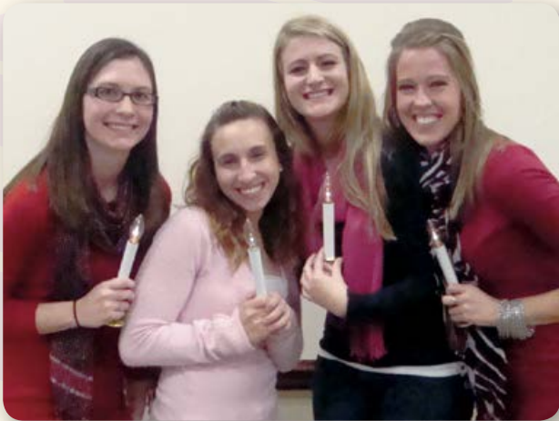
Fall Candlelighting Ceremony